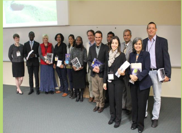
Recipients of SEER publications from developing countries

In addition, the Academy is hugely indebted to the American Bar Association Section of Environment, Energy and Resources (SEER) for continuing to generously support our annual colloquium by donating some of its publications for scholars from developing countries. The SEER books were presented to some of these scholars during the Colloquium. The Academy looks forward to further collaborations with SEER in our future colloquia.