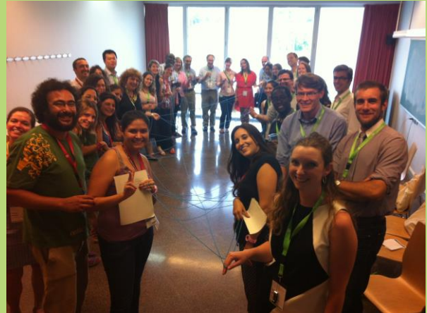
Graduate Student Forum

followed by a question and answer session between students and faculty experts. This session allowed graduate students to engage with each other and to make connections with senior academics with similar research interests.