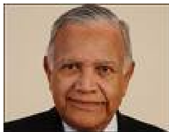
Judge Christopher Weeramantry

The Faculty of Law welcomed Judge Christopher Weeramantry to Ottawa. Judge Weeramantry drew on his experiences with the International Court of Justice. He addressed the importance of judges having knowledge of environmental law and international law and noted his own efforts to enhance understanding of the importance and potential of international law.