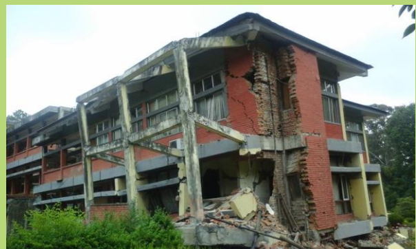
Damage to Tribhuvan University caused by earthquake

Name: Tribhuvan University Bank : Nepal bank Ltd, Kirtipur Branch, Kathmandu, Nepal Account No: Account No: 45-10-84173 Swift Code: NEBLPKA