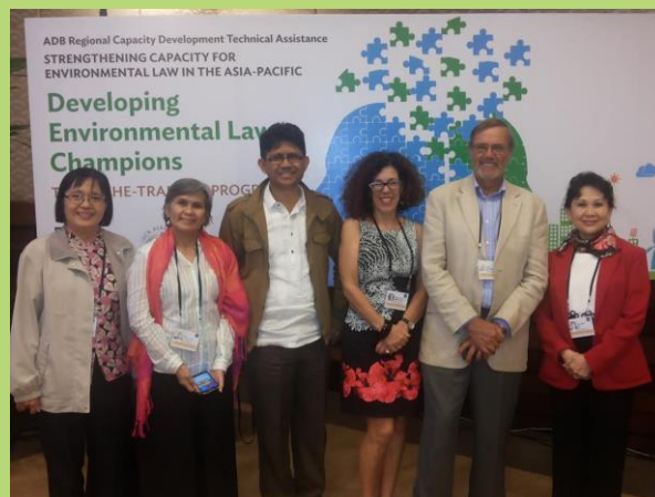
Train the Teachers program sponsored by Asia Development Bank held in Manila in March 2015

Academy’s e-Journal; and, co-ordinating the selection of prizewinners for the Emerging and Senior Education Awards. In particular, the pre-colloquium workshops have proved a popular and informative way of focusing on good practices in the teaching and learning of environmental law at the international level.